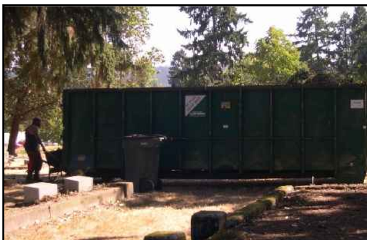
This 32 foot Commercial Dumpster got filled!

(Initially, the tall grave marker could scarcely be seen.)