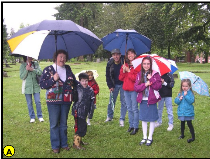
A Folks Came Out to Watch – with Umbrellas in Hand!