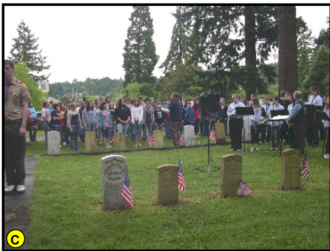
C "The Star Spangled Banner" Shasta School Choir with Young Men's Ensemble