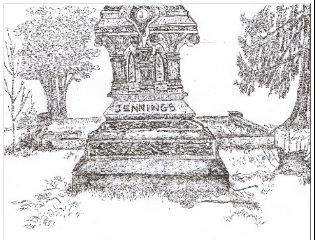
The Jennings Family Lot (Lot No. 177)