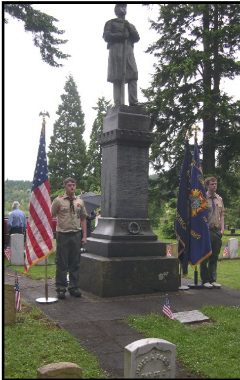
BOY SCOUTS FROM TROOP 182

( Cont. on Pg. 2 TRADITION AND RESPECT... )