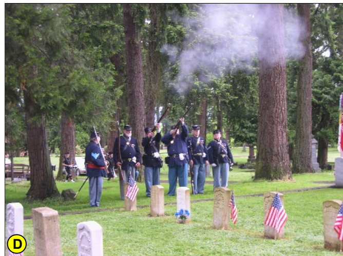
D "Black Powder Salute" Sons of Union Veterans of Civil War