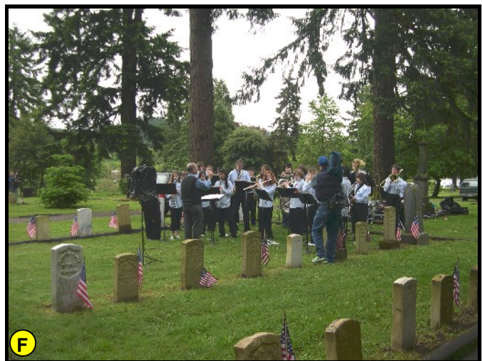
F "Valdres March" – Shasta Symphonic Band